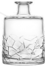
JUPITER POLARIS 700 ml