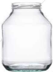
CHLORIS 1700 ml