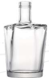
PHOENIX 700 ml