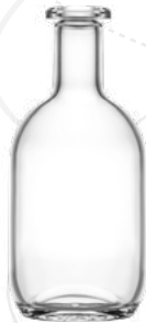
LUNA 700 ml