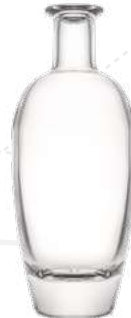
EGG 700 ml, 750 ml