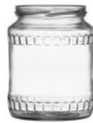
MARBLE 720 ml