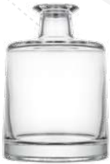
JUPITER 500 ml, 700 ml