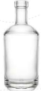
DIABOLO 50 ml, 500 ml, 700 ml, 750 ml