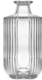
LYRA VINTAGE 500, 700 ml