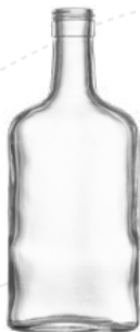
PEARL 500 ml, 1000 ml