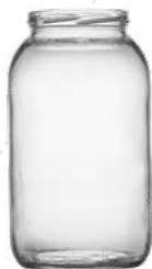
HOWLUXE 1500 ml