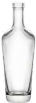
ALASKA 750 ml