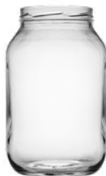
ANHIDORA 2500 ml