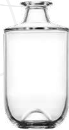
LYRA 200 ml, 500 ml, 700 ml