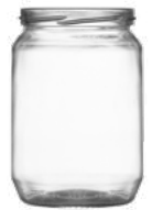
QUARTZ 720 ml