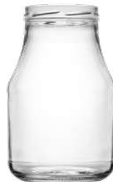
CHRYSO 2650 ml